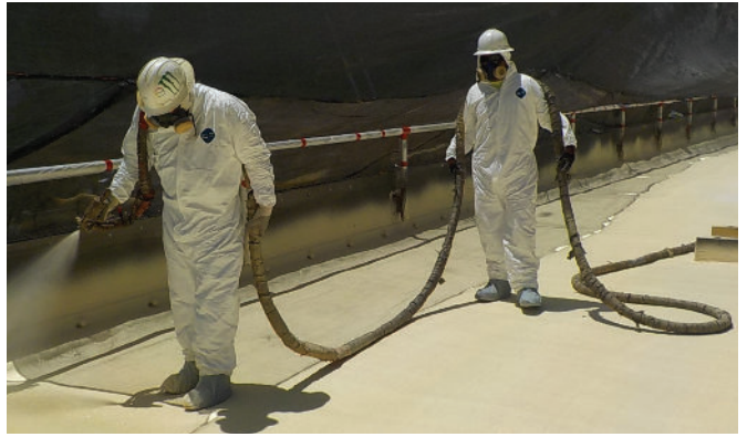
Application of SPF on a low-slope roof.

Elastomeric coatings are typically specified by the foam supplier as part of a SPF roof system and can include acrylic, silicone, butyl rubber, polyurethane and polyurea.