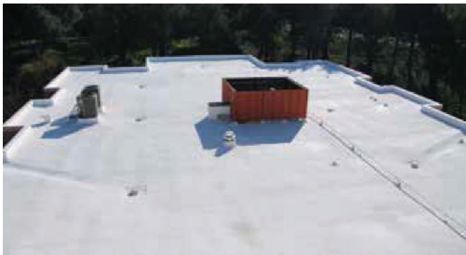
SPF roofing applied promotes enhanced drainage.