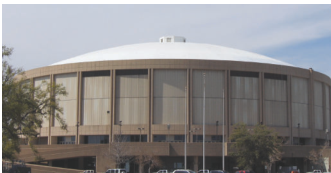
The SPF roof on the Biloxi (MS) Coliseum survived 12 hurricanes since 1979.