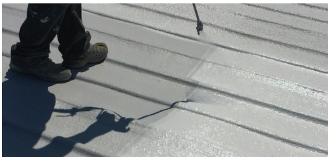
Application of SPF over a metal roof followed by an acrylic coating.