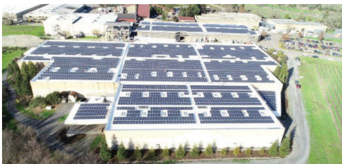
SPF roof with photovoltaic panels at the Rodney Strong Vineyards in Healdsburg, CA.