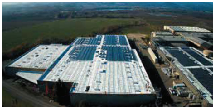
SPF Roofing installed below roof-mounted photovoltaic panels (during panel installation) on the Rodney Strong Vineyards facility, Healdsburg, CA.