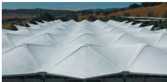
SPF roof installed over an unusual roof design at Birkenstock headquarters in Novato, CA.